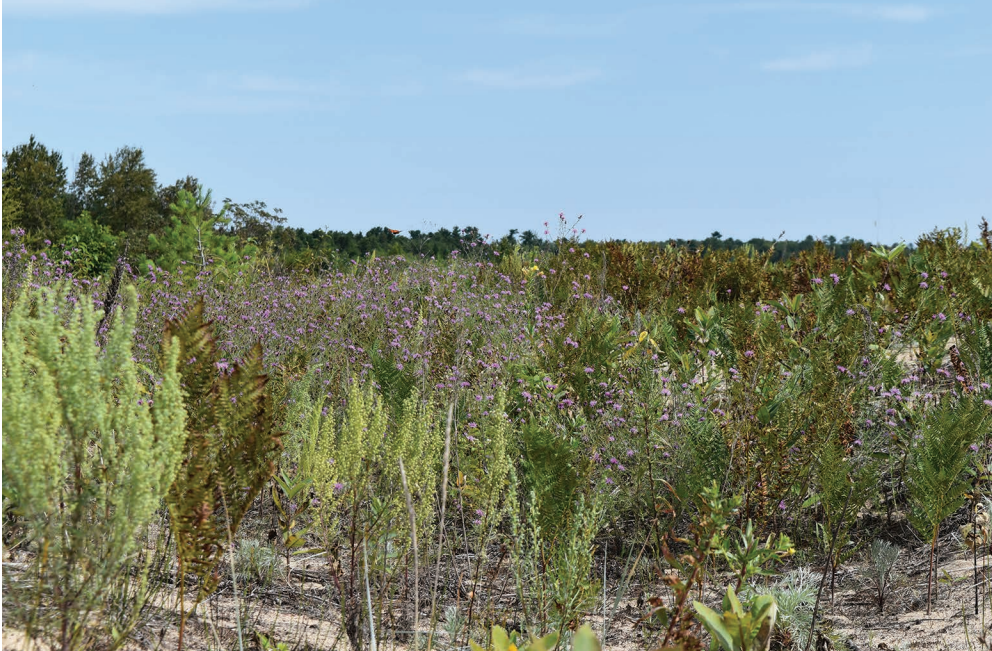
Figure 2: Star thistle population extending along the swales and parabolic dunes of Beaver Island. Newly emergent monarch butterflies spend over a week exclusively nectaring at the flowers, prior to the first (“early”) wave of monarch migration from the island at the end of August. Monarch butterflies are now found on the island well into late October.

(10 acres). Despite this recent and successful invasion, there has apparently not been any significant change in the Solidago L. (goldenrod) populations upon which migrants apparently used to rely (B. Leuck personal communication 2018).