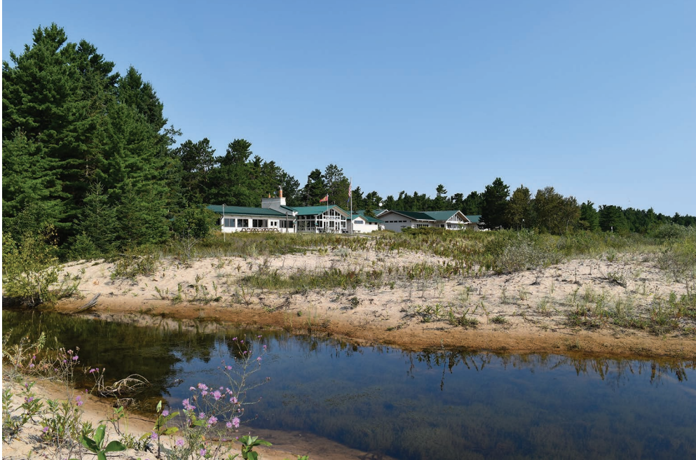
Figure 1: Central Michigan University Biological Station on Sandy Bay, Beaver Island. Star thistle is shown in foreground. The invasive star thistle has established extensive populations along the swales and parabolic dunes running the circumference of the island.

observed nectaring almost exclusively on star thistle, also known vernacularly as spotted knapweed ( Centaurea stoebe L.) that dominates the swales and parabolic dunes throughout Beaver Island, part of a small archipelago of nine islands located in Lake Michigan, about 45 km due west of Charlevoix, Michigan at latitude 45.67 N, and longitude 85.55 W. It measures 145 km 2 (about 60 square miles). Just north of Beaver Island resides Hog Island with a “natural state” flora of nearly 93 percent (Whately et al. 2005) and thus most of the flora is native and, in a few cases, endemic, leaving this isolated ecosystem of Lake Michigan islands relatively untouched by invasive species, save for the shoreline environments. This observational study has been conducted over a number of years at Sandy Bay, in front of the Central Michigan University Biological Station on Beaver Island. During mid-and late August of 2017, an unusually large population of monarch butterflies emerged and in the course of a week assumed typical migratory behavior (Fig. 2).