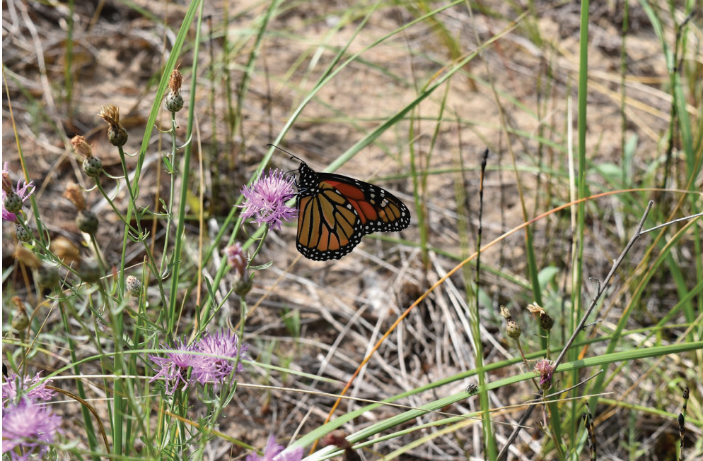
Figure 3: Monarch adult foraging at one of the many blooms of a single star thistle plant, late August, 2017.

with the introduction of numerous predatory arthropods that prey on various parts of the plant, including the moth Metzneria paucipunctella Zeller, the knapweed gall flies, Urophora affinis (Frauenfeld) and U. quadrifasciata (Meigen), the cochylid moth Agapeta zoegana L., and the beetle Sphenoptera jugoslavica . Obenberger (Lym et al. 1992, Clark et al. 2001). However, mechanical control, biological control, or chemical control or combinations thereof have not yielded significant results anywhere in North America, and the species continues its invasion eastward (Smithsonian.com 10.21.17).