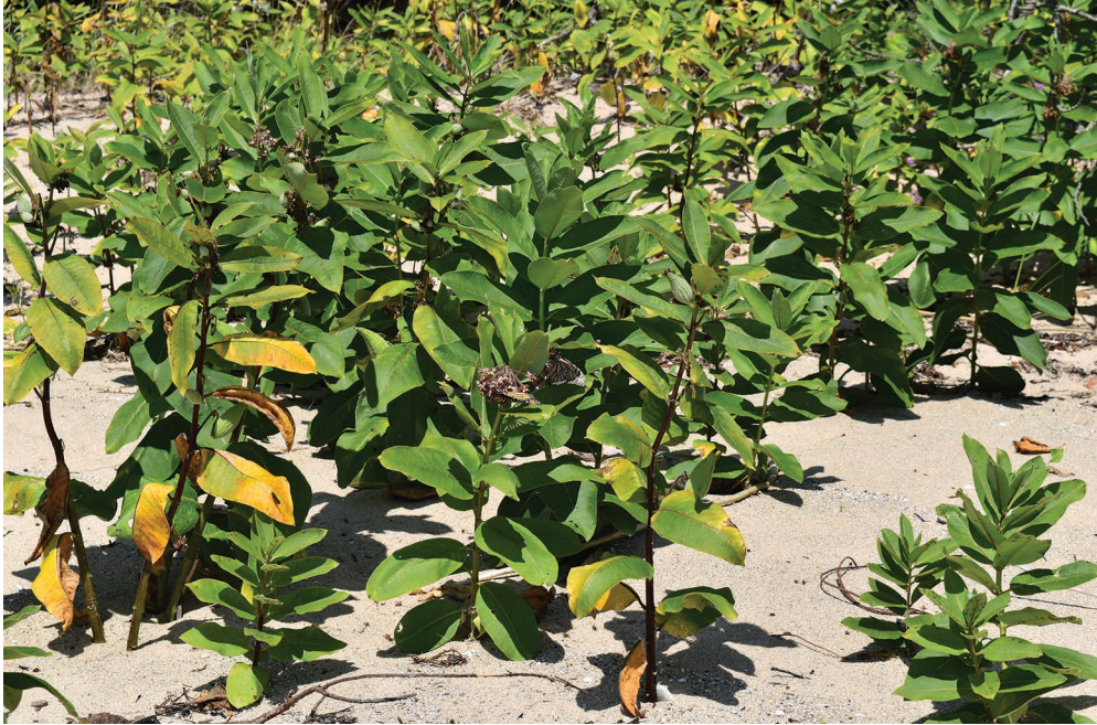
Figure 4: Common milkweed ( Aesclepias syriaca ) forms dense monocultural stands along many areas of the Lake Michigan lakeshore on Beaver Island. Note the two newly emergent monarchs nectaring on the milkweed blooms in the front (second milkweed from the left) of the picture.

during the migratory period from northern Michigan is not known, but it is likely that eradication efforts will demand a great deal of time and money, and the ultimate goal of eradication will prove extremely difficult if not impossible.