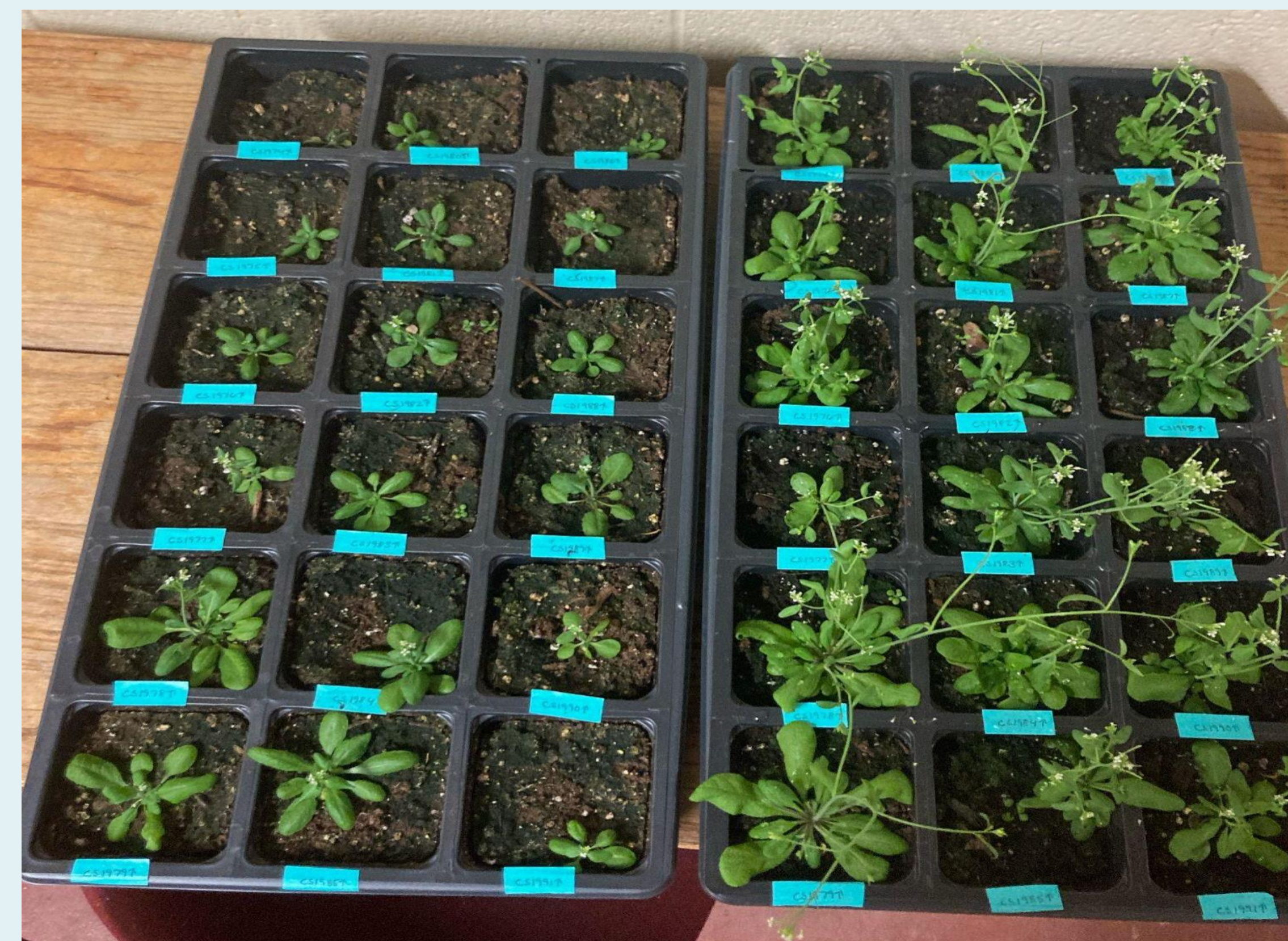
Figure 1: Experimental (left) and control (right) plant beds after 6 weeks of growth, including 1 week of drought conditions for the experimental beds.

The recombinant inbred lines of Arabidopsis thaliana were obtained from the Arabidopsis Biological Resource Center at the Ohio State University and are a cross of Ler (Landsberg erecta ) x Col (Columbia). The seeds for each line were placed in the soil in individual pots (Figure 1). In order to allow for proper germination, temperature (25°C) and light conditions remained consistent between the two trials.