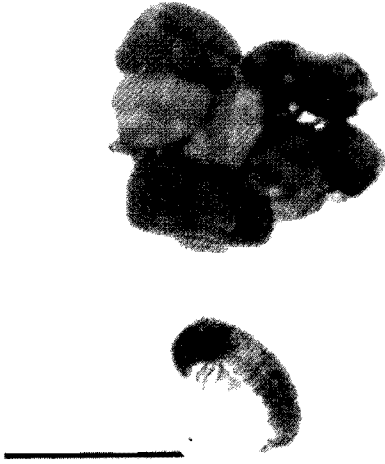
Figure 1. Glossosoma nigrior larvae, with and without case; bar = 6 mm.

have been found in 49 of 62 examined streams supporting G. nigrior populations (M. Wiley, pers. comm.). The pathogen has also been found in the upper peninsula of Michigan in 4 of 21 examined streams, and in Maine in 10 of 13 examined streams (M. Wiley, pers. comm.). Subsequent to epizootics, which were first observed in 1988, several previously undetected species of caddisflies were observed in streams that had been dominated by G. nigrior , such as Agapetus hessi and Neophylax oligius . The timing of their appearance suggests that these species were competitively excluded by G. nigrior (Kohler and Wiley 1997). Recurrent Cougourdella sp. epizootics appear to be responsible for maintaining G. nigrior populations at low but detectable levels (Kohler and Wiley 1992) and increasing the faunal diversity among filter-feeder and grazer feeding guilds (Kohler and Wiley 1997). In the laboratory, we observed that infected G. nigrior usually lyse after death, releasing large numbers of environmentally resistant spores (environmental spores). These environmen-