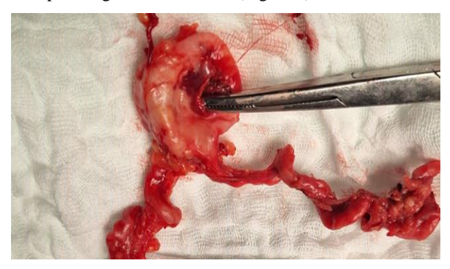
Figure 3 . The macroscopic appearance of the aneurysm and the splenic artery

After the surgery, the excised pieces were sent to the pathological anatomy department for macroscopic and histopathological examination (Figure 3).