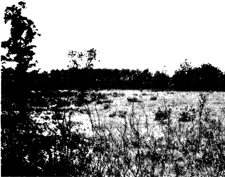
Fig. 3. Habitat of Oarisma powesheik on the Vita prairies. The location shown is 1.5 miles east of Stuartburn.

vulgaris , with scattered shrubs of Salix petiolaris , Potentilla fruticosa , and Betula glandulosa . The higher, drier parts are dominated by Sporobolus heterolepis , Andropogon gerardii , Andropogon scoparius , and include many other prairie species such as Zygadenus elegans , Solidago rigida , Elaeagnus commutata and Liatris ligulistylis .