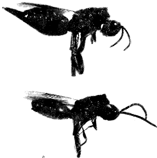
Fig. 1. Phasgonophora sulcata adults ( \times 6.3 ): female (top), male (bottom).

mental chambers at 20°, 24°, 28°, and 30°C. Adults were removed daily and the number of days to emergence was recorded. Mean developmental time in days was calculated by species for each temperature. The developmental threshold temperatures and their respective linear equations were determined from the 24° and 28°C data.