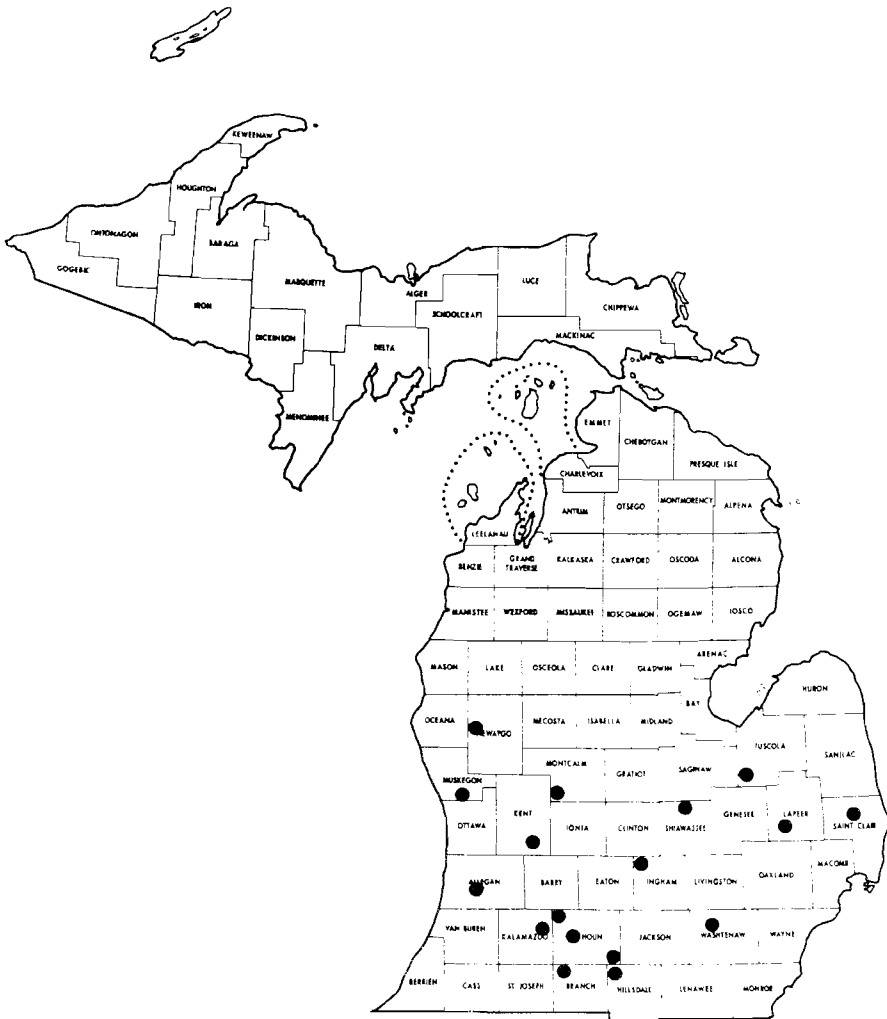
Fig. 2. The distribution of Corydalus cornutus (L.) in Michigan, June, 1966, to July, 1969.

C. cornutus larvae were generally collected from cobble-boulder substrata. They were especially abundant below dams, preying on abundant simuliid larvae and other filter feeding organisms.