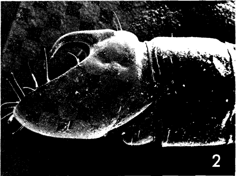
Figs. 1 & 2. Larva of Dioedus punctatus LeConte, abdominal segments 8 & 9: Fig. 1, dorsal aspect; Fig. 2, lateral aspect.