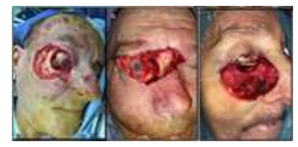
Figure 2 . (A) surgical removal of the tumoral masses with adequate surgical margins with bone extension, including periocular fat. (B) wide excision of the giant cell carcinoma of the glabellar region. (C) wide excision of the giant cell carcinoma of the lower eyelid.

intubation and consisted of the surgical removal of the masses with adequate surgical margins (Figure 2).