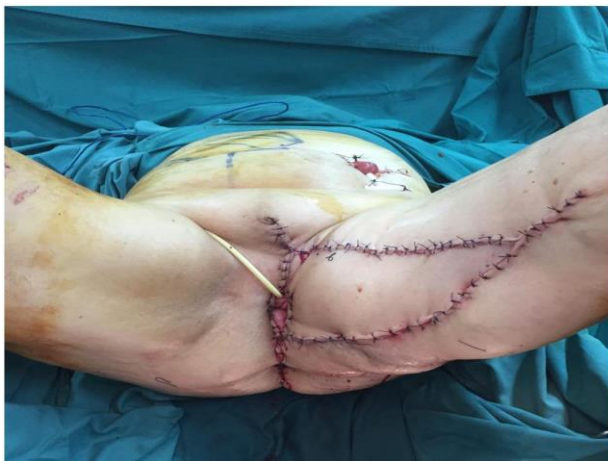
Figure 4. Coverage by a V-Y flap of the inner thigh

Frozen section examination pointed to free limits, but final histology exams showed involved margins. Due to the multiple recurrences of the disease and the involved margins, the patient was proposed for external beam therapy. But radiotherapy was rejected due to the extent of the target volumes. The multidisciplinary committee indicated a topical therapy with Imiquimod 5%. The patient underwent local therapy with imiquimod 5% twice a week for 6 months. At the time of this publication, the patient is 68 years old and she had no recurrence in the first 36 months after treatment.