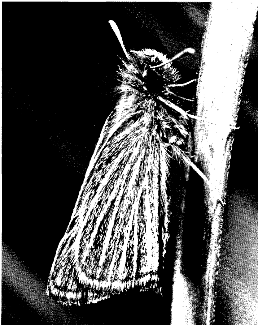
Fig. 1. A male Oarisma powesheik in a typical rest position.