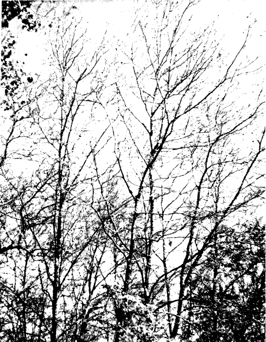
Fig. 1. Young oaks completely defoliated by A. semiferranus in 1968 in Oscoda County, Michigan, at peak of the outbreak.

it was A. semiferranus as in the 1965-70 outbreak. The population started to build up in 1955, and in 1956 the insect defoliated oaks on 214,500 acres in Crawford County. The infestation peaked in 1957 when it covered some 350,000 acres in parts of Crawford, Roscommon, Ogemaw, and Oscoda Counties. Branch mortality occurred that year. By