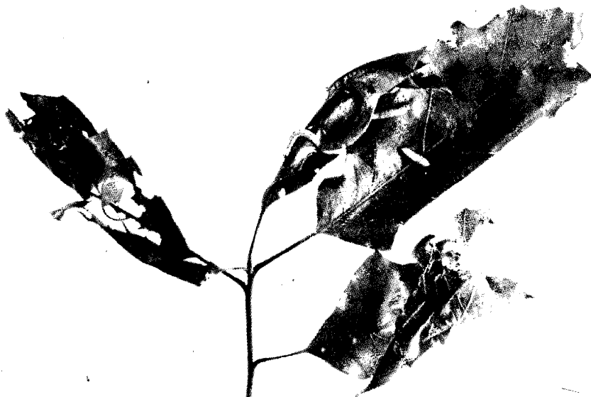
Fig. 5. Typical leafrolling of last two instar larvae of A. semiferranus .

by several terminal abdominal hooks. In early July the adult ecloses and vacates the leafroll through either end of the cavity. Moths were occasionally observed on the foliage during the day and were only seen in flight when disturbed. Oviposition behavior was not observed. Freeman (1958) notes that the large brush of closely packed, corrugated scales on the undersurface of the female is likely the group used to cover the eggs.