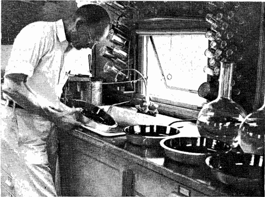
Fig. 2. The interior of the laboratory.