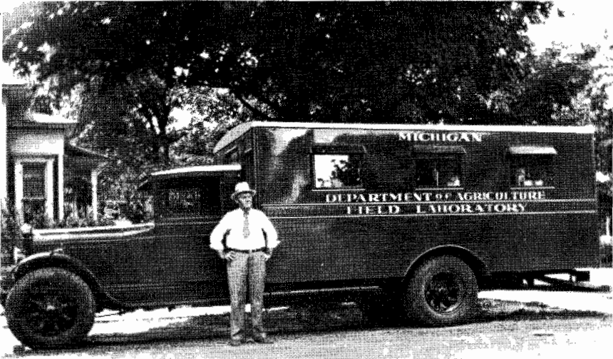
Fig. 1. Michigan Dept. of Agriculture field laboratory, 1931.