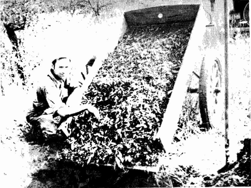
Fig. 4. Infested cherries being dumped into a pit.

observed was R. cingulata on June 3 at Niles in Berrien County. This is unusual because R. fausta , which usually emerges first, was not reported until June 7 from a cage in Van Buren County. In 1939, the most heavily infested pint sample, from which 211 maggots were recovered, was taken on June 18 in Kent County. Table 1 shows the earliest dates that adult cherry fruit flies were observed during the ten year period 1930-1939.