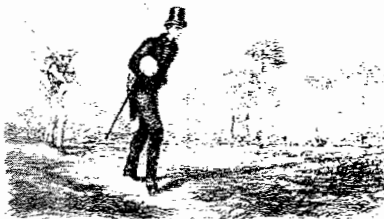
The gentleman collector. Maurice Sand, Le monde des papillons (Paris, 1867), 143.