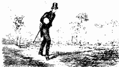
The gentleman collector. Maurice Sand, Le monde des papillons (Paris, 1867), 143.