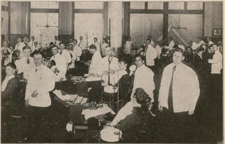
SOUTH VIEW OF THE DENTAL INFIRMARY