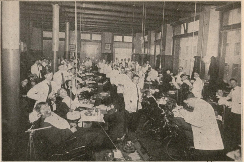
NORTH VIEW OF THE DENTAL INFIRMARY