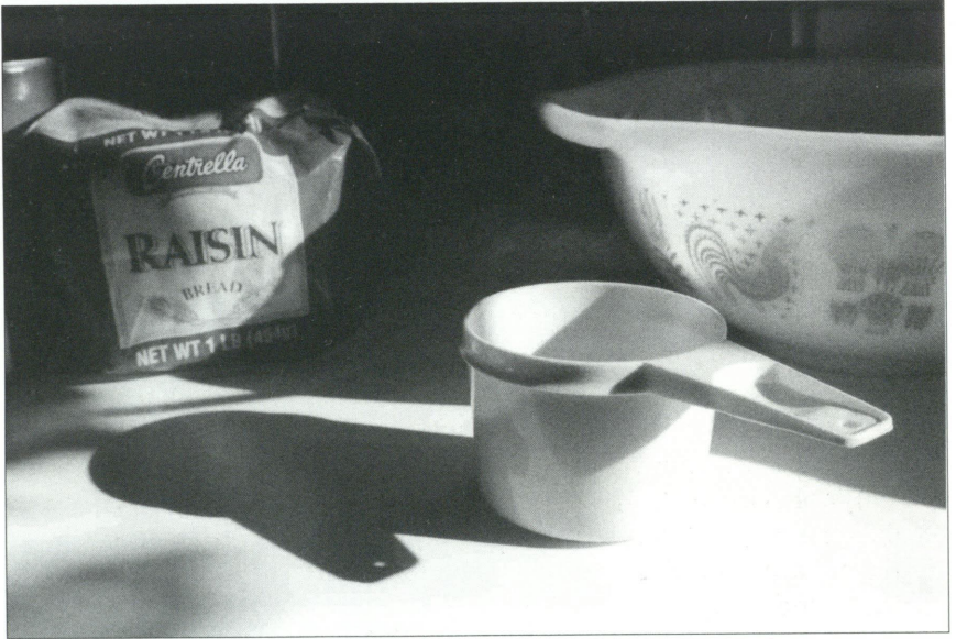
Crumb Stash Melanie Schaap