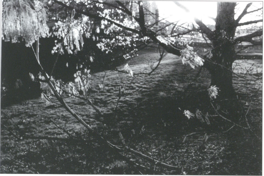
A Fall Afternoon Holly Sagarsee