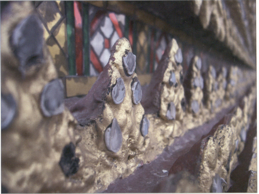
Wat Po, Bangkok