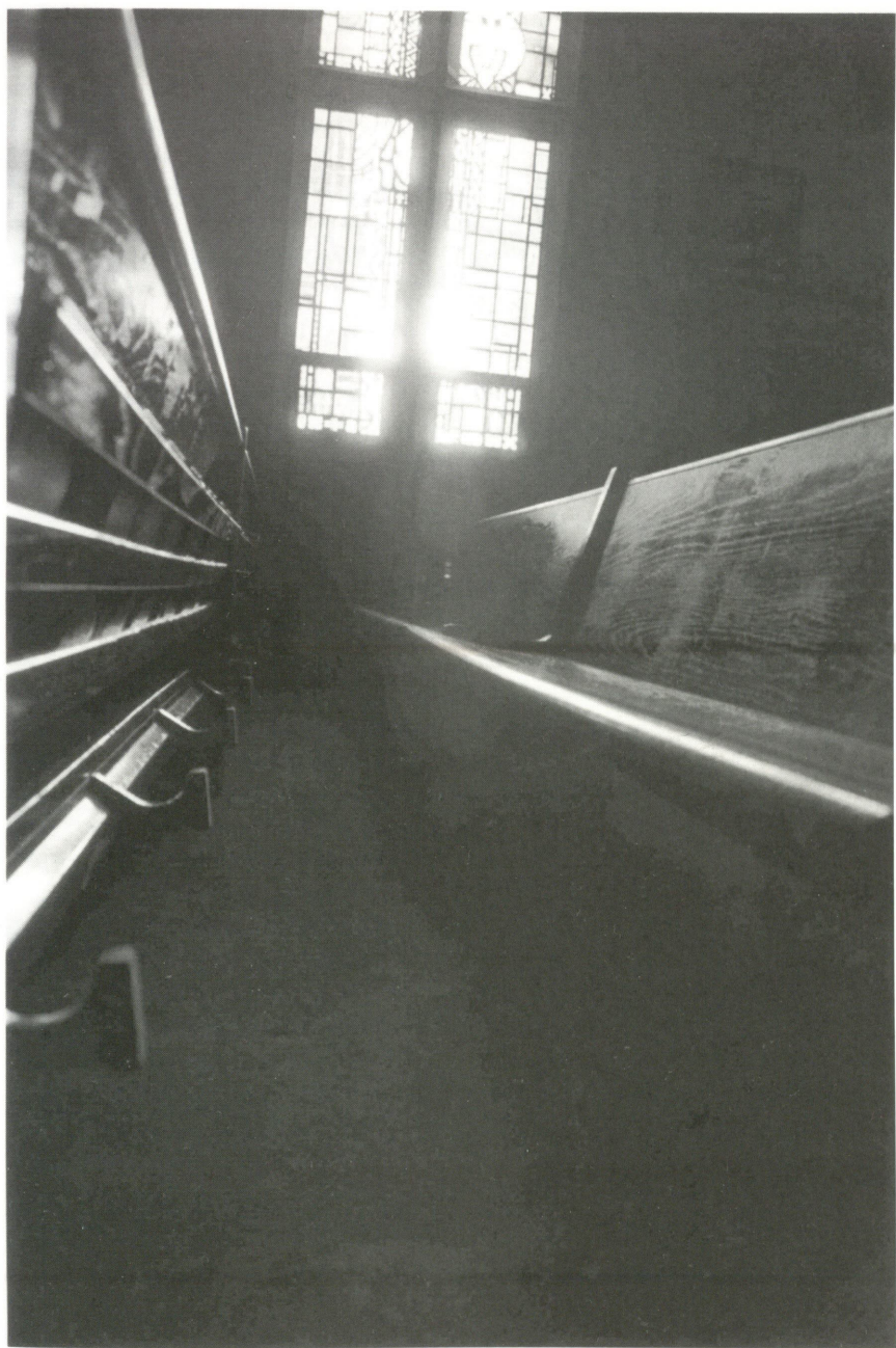
Church Pew Holly Sargasee