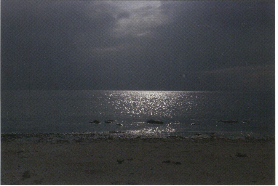
Sun on Blackwaterfoot, Scotland Shana Heller