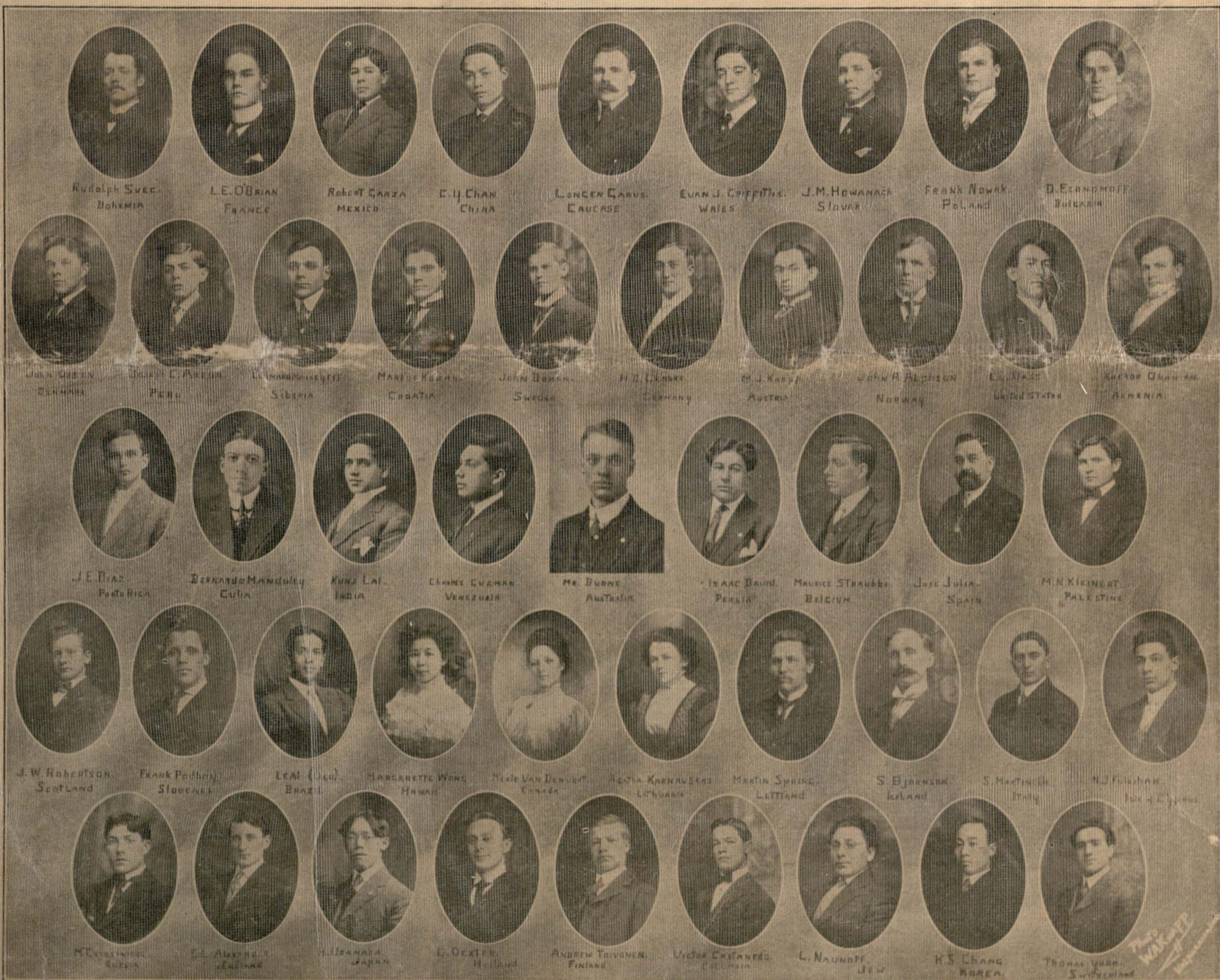
This cut shows representatives of 47 of the 55 nations from which Valparaiso has students. A number of these representatives are American citizens but foreign born.

Valparaiso university is a congress of the world. Here rich and poor meet on a level, and cheek by jowl they sit at meat. The Porter county boy or girl who drives in from six miles out, and the