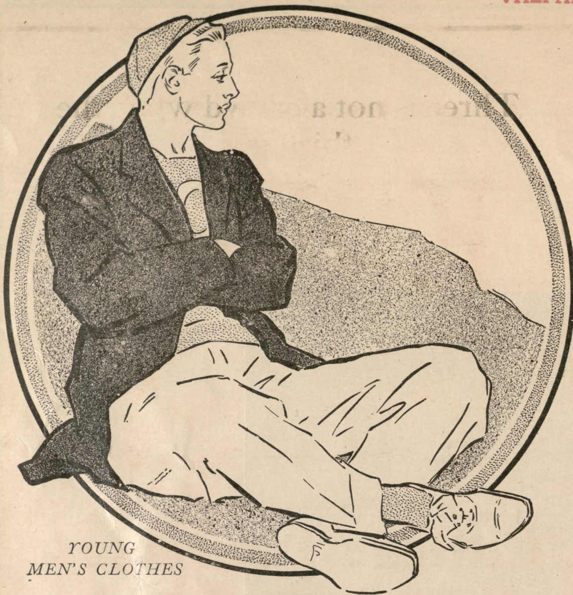
YOUNG MEN'S CLOTHES