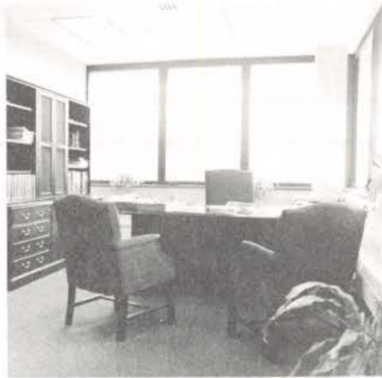
Office of the Dean