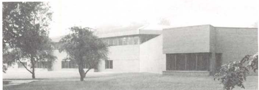
Northwest view of Library

Since this year marks the ten year scheduled immediately following the reunion for the Class of 1976, special dinner at the Court Restaurant, upstairs banquet room. Plans are also Homecoming arrangements have been made. Please mark your calendars and plan to return to Valparaiso for all the festivities. Special seating has been reserved at the Saturday, October 4, 1986, Homecoming Banquet, at Strongbow's Inn. Please be sure and include your graduation year on the reservation form. A special reception for the Class of 1976 is scheduled immediately following the dinner at the Court Restaurant, upstairs banquet room. Plans are also underway for a Sunday brunch and/or picnic gathering. For the early arrivals, Barb Young is hosting an Open House, Friday, October 3, 1986, beginning at 8:30 p.m. For more specific details and location, call Barb at either 464-4961 or 464-1912.