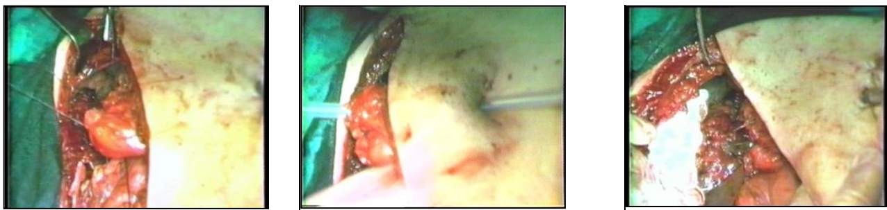
Figure3. Some of the technical aspects involed in the procedure. From right to left: sectioning the round ligament near its hepatic insertion, crossing the drainage tube through it and fixing the free end of the ligament to the chistectomy.

The technical procedure implies draining of the residual hepatic cavity, through an extraperitoneal route that does not communicate with the peritoneal cavity in order to avoid any abdominal postoperative complication and through the transposed round ligament detached from the liver. The process of transposing the round ligament detached from liver respects the principle of the method and widens the area of usage for this type of drain for any hepatic localization of the precedent resting cavity (Fig. 3).