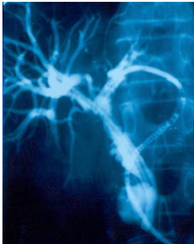
Figure 1. C-Arm colangiographic control in preparation for patient discharge, performed after 3 months of continuous drainage. The slide exhibits no signs of fistulae and therefore a good choledochoduodenal anastomosis was achieved.

biliary drainages, received as solution a biliodigestive anastomosis protected by a biliary transanastomotic axial drainage.