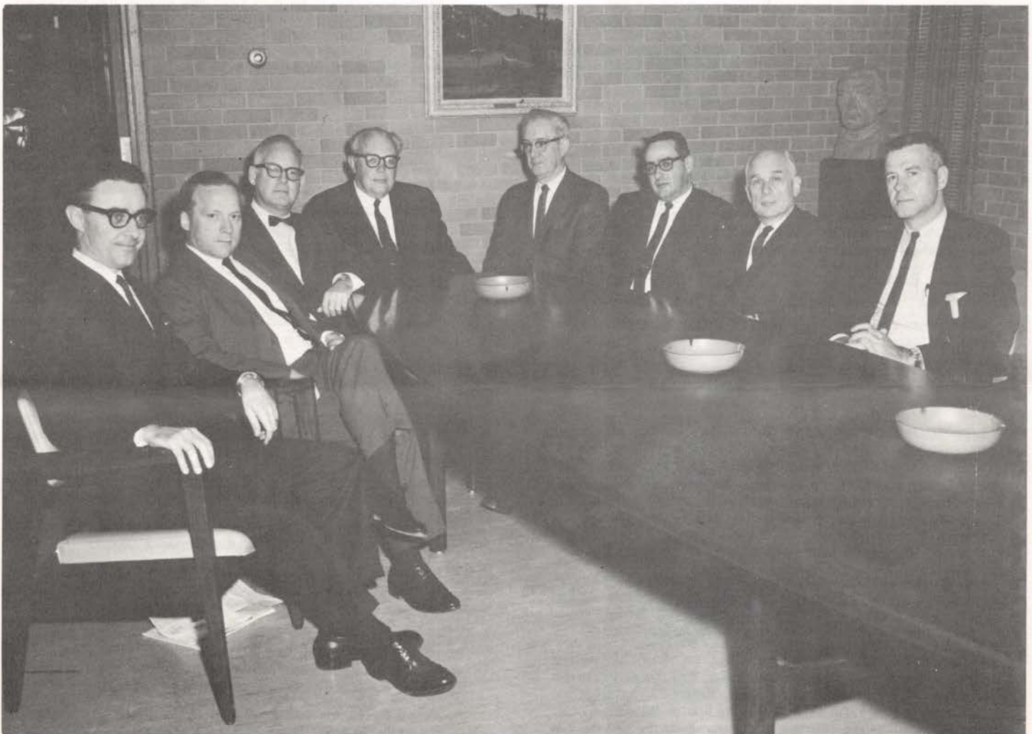
VALPARAISO UNIVERSITY SCHOOL OF LAW BOARD OF VISITORS