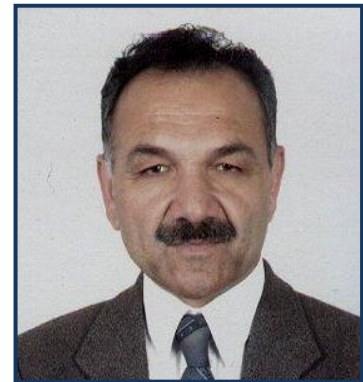
ZEENAT SHAH PROFESSIONAL DEVELOPMENT CENTER NORTH AGA KHAN UNIVERSITY PAKISTAN